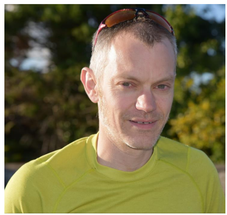
fuel like you do with a marathon. 50k as well, I've done several. I've done Portumna twice.

I really like doing the half marathon. If something goes wrong, you've got a bit of time to adjust. You don't have to worry about