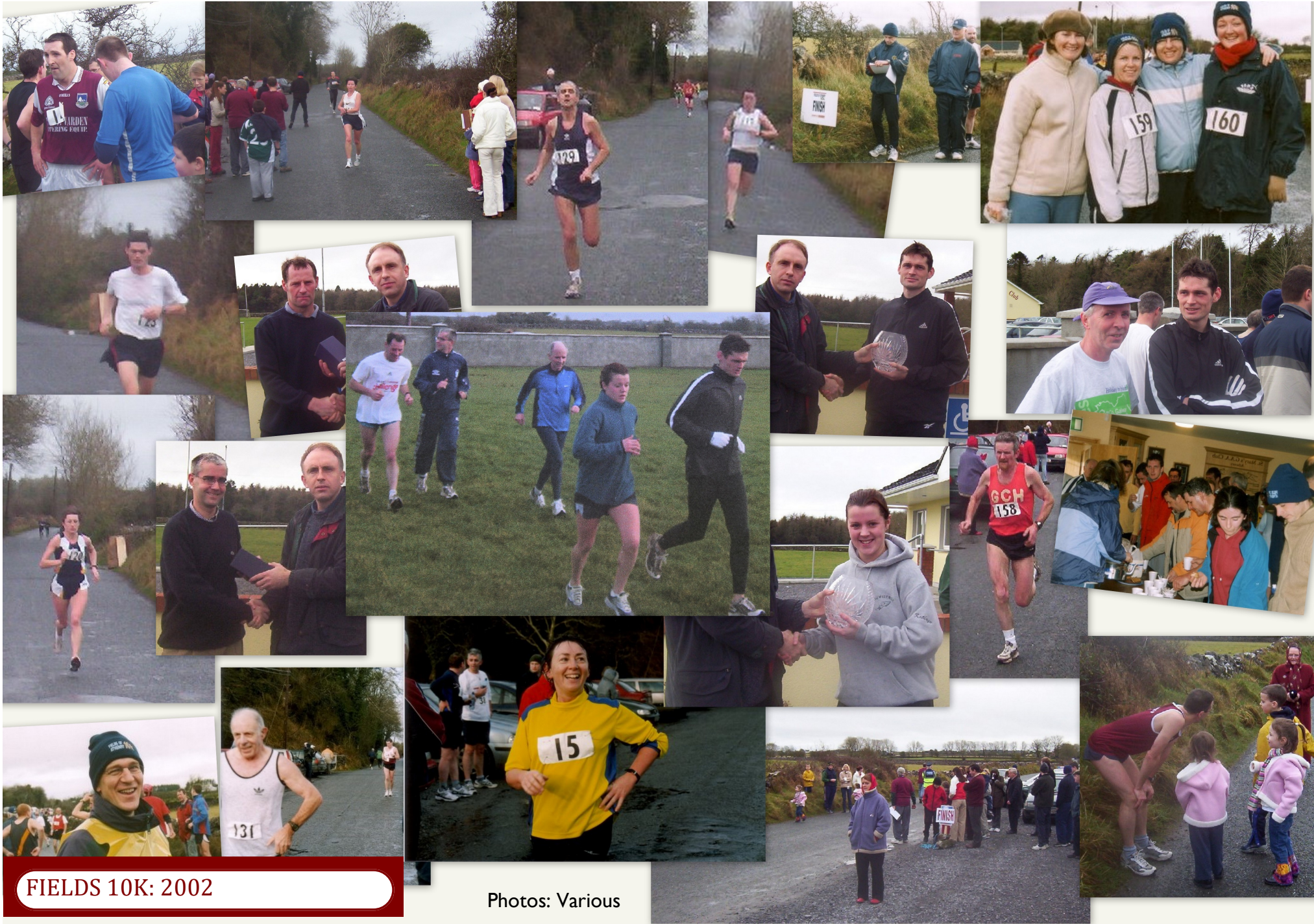
FIELDS 10K: 2002