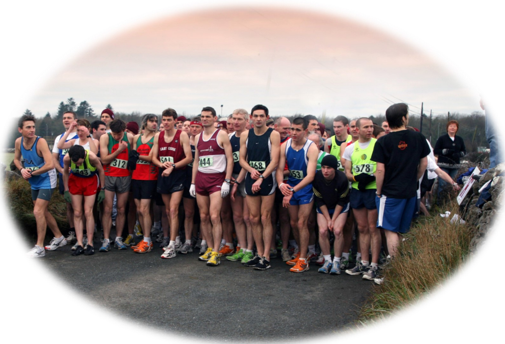
Our first start venue for the Fields of Athenry 10k near St. Mary's GAA club, Carnaun. The photo shows the start of the 10k, 2005.