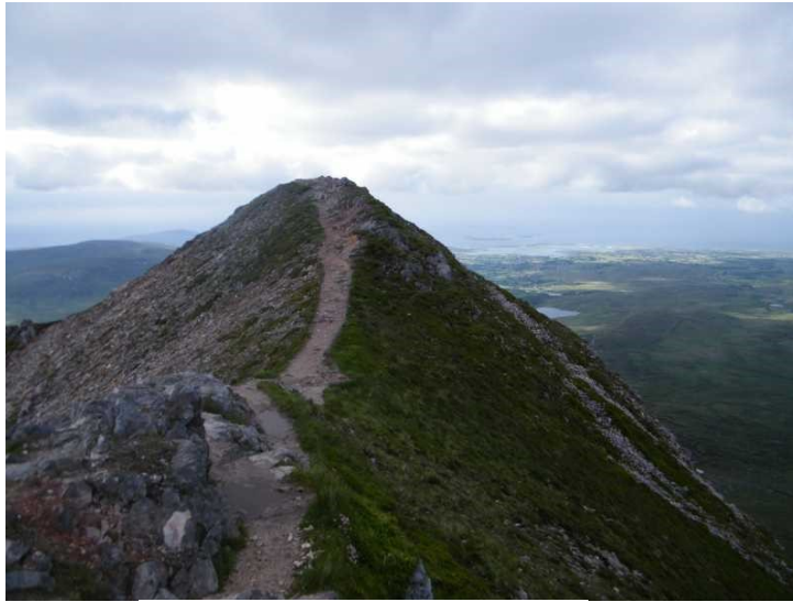
The Ridge of Errigan mountain

We got to the base and started heading up the ridge, I took the lead, put my head down and kept telling myself not to stop for any breaks, "keep pushing, keep pushing" was all that went through my head. There are parts of the climb where you are down on your hands and knees and funnily enough, I find this easier climbing, your back gets a bit of a rest along with your quads so I didn't mind it at all.