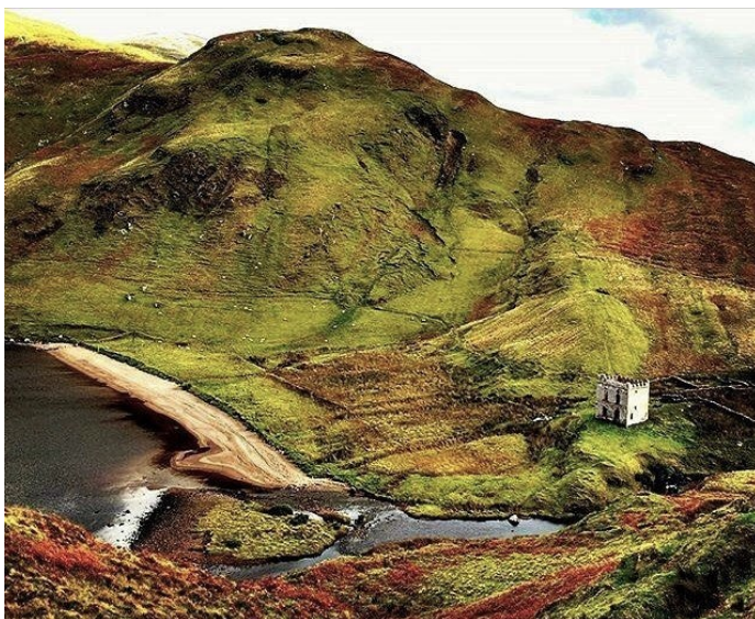
Lough Altan with beach

From the summit of Mackoght I looked over at Errigal: it looked daunting, the steep North Ridge that we had to ascend looking wind-battered and rocky. I descended to Checkpoint