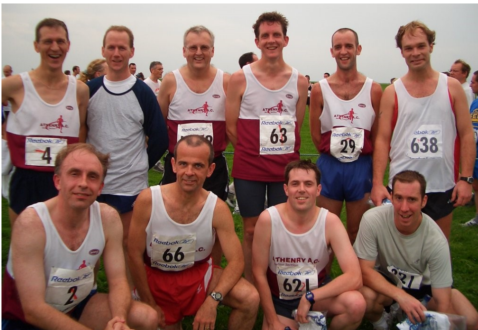
Early days: Streets of Galway 8k, 2004.