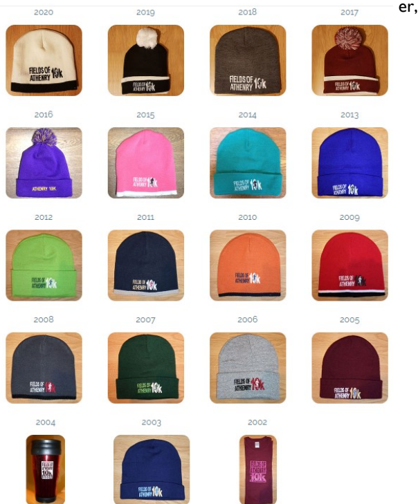
The famous wooly hats