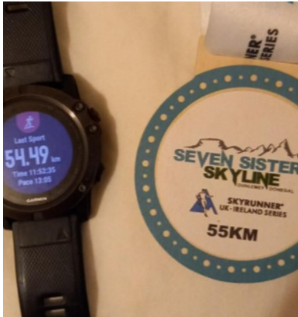
Finishing time: 11:52:35

This time I rested for a couple of minutes, it seemed to ease them again momentarily so on I went. I finally reached the 740m summit after what seemed like an eternity and almost cried with relief, there was still 8kms of racing left to do but the mountains were now out of the way, I think I was even more elated at this point than I