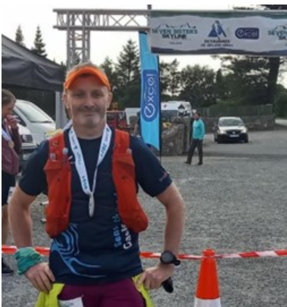
Still standing, just.