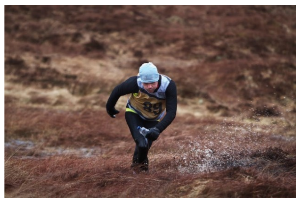
A runner on Muckish mountain, Donegal

cent night's sleep (which is rare before a big race) I trotted up to the start line 15 minutes before the off. I had set out a race plan for myself the night before and wrote it down, so I pulled it out