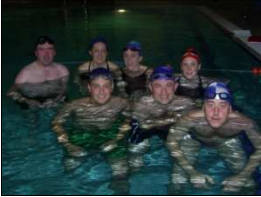
Predator Triathlon Club – A force to be reckoned with.

is quite an overlap in membership between the two clubs at this stage. Athenry AC's Saturday morning training runs are adapted to suit any Triathletes who want to participate in them as part of their usual triathlon specific training.