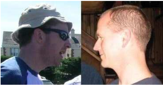
Head To Head During 2006 – Men of Steel

At last year's AGM it was suggested that we institute a fun competition between members to select, from amongst our own number, an 'Athlete of The Year'. It was decided to conduct the competition on the basis of awarding points for participation in competitive events. As most current members are runners this, in the main, constituted road, cross-country and track races. We didn't forget that we have a very talented jumper in our ranks but they would have had to have jumping all year to keep up with some of the seemingly indestructible runners in the club.