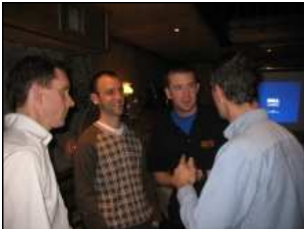
These Men Need No Encouragement

As the club expands to take in more runners we need more leaders and I really believe that each and every member can lead in some way or other.