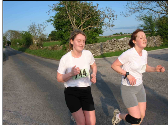
Competitors in the Athenry 5K