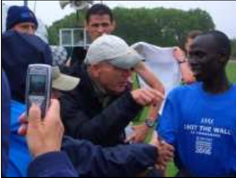
Ugandan Cross Country Star Isaac Kiprop in Dangan

unluckily finishing just outside the medals and claiming fourth position in both races.