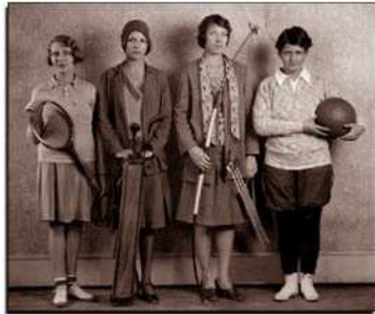
Where Have They Gone ...?

As a club we've enjoyed quite an amount of success in recent times, not only in competition but in terms of providing an opportunity for many people to get fit and enjoy their athletics. We have however signally failed in one particular area and that has been in attracting more female athletes to join the club. It's an unfortunate truth that when we travel to races or train as a group it tends to be a bit male dominated.