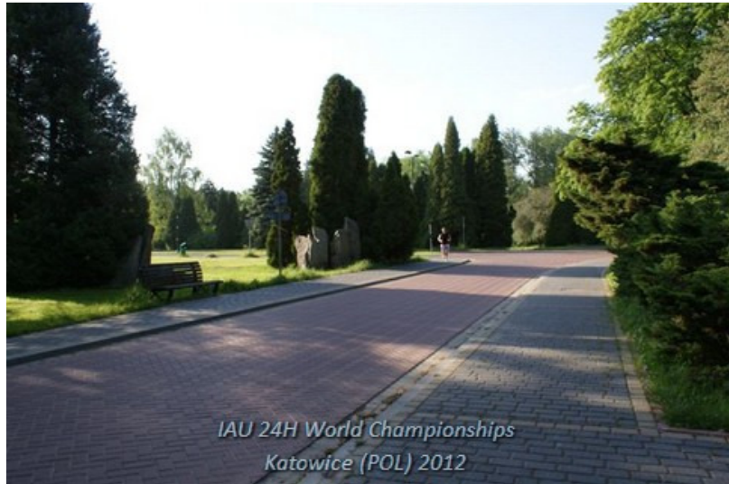
IAU 24H World Championships Katowice (POL) 2012