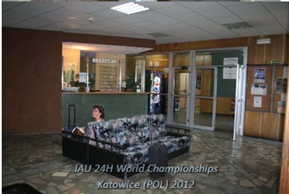
IAU 24H World Championships Katowice (POL) 2012