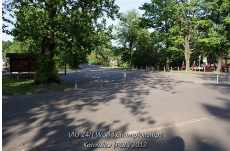
IAU 24H World Championships Katowice (POL) 2012