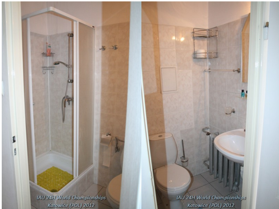
IAU 24H World Championships Katowice (POL) 2012