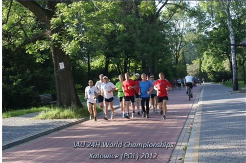
IAU 24H World Championships Katowice (POL) 2012